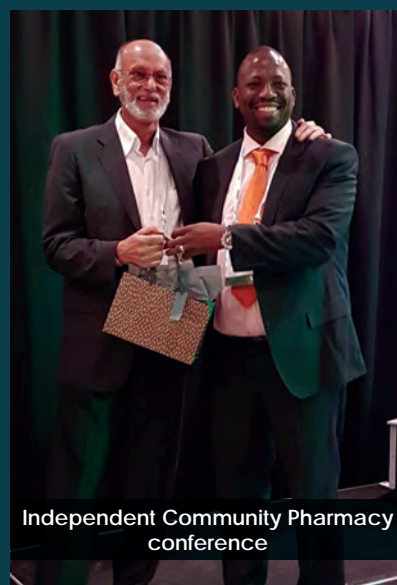
Independent Community Pharmacy conference

As a pharmacist, the profession in South Africa faces many challenges, hence his involvement in various formations promoting the interest of Independent Community Pharmacists of the country.