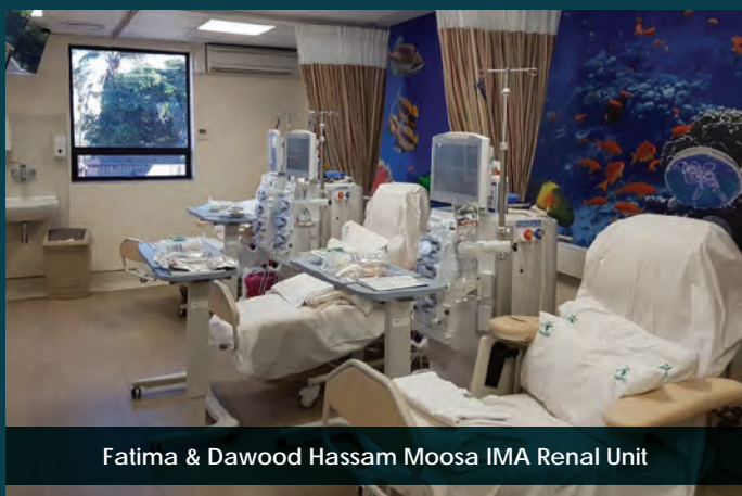
Fatima & Dawood Hassam Moosa IMA Renal Unit