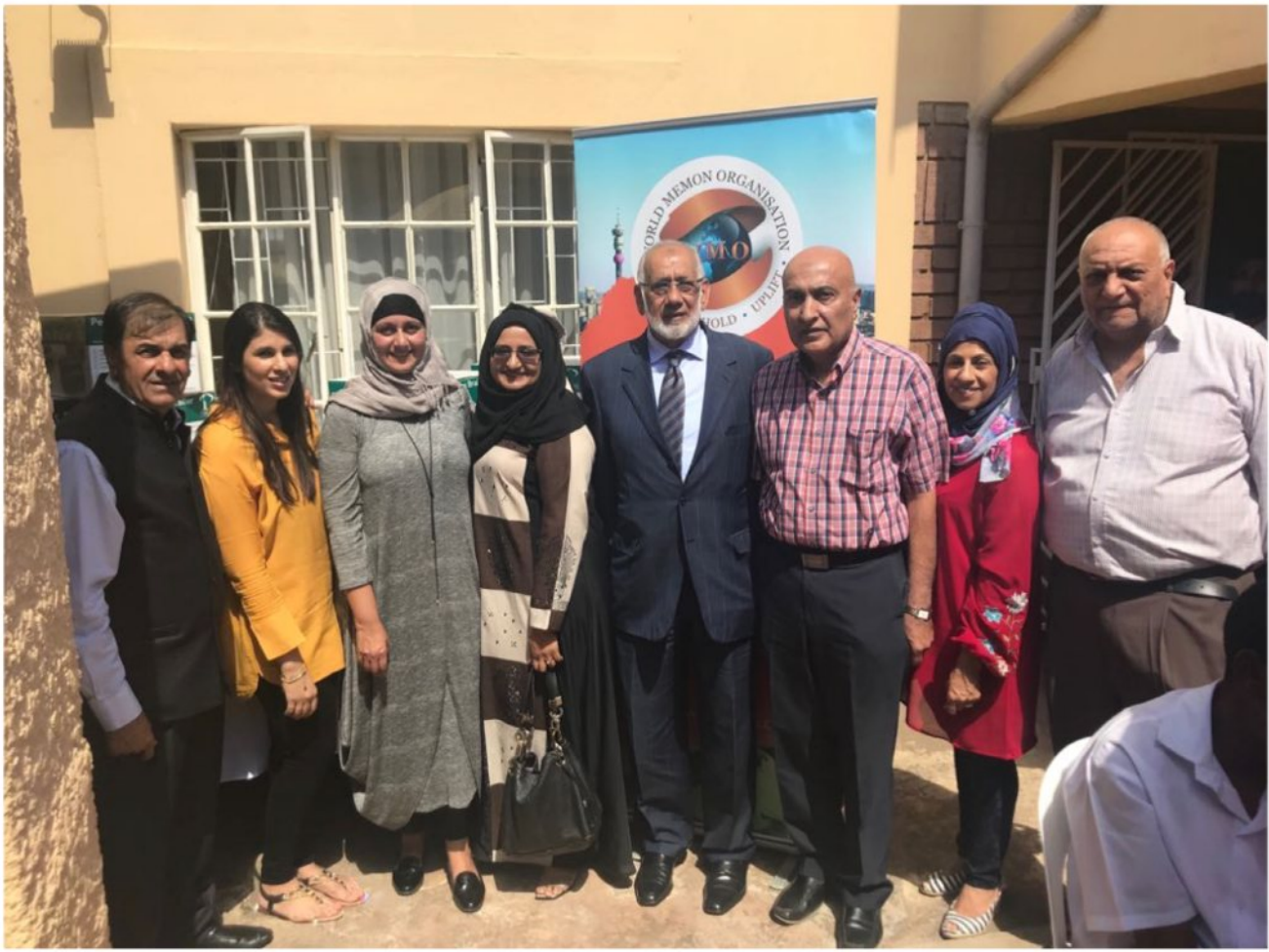
The Deputy Minister of Home Affairs, Honourable Fatima Chohan, graced the occasion with her presence.