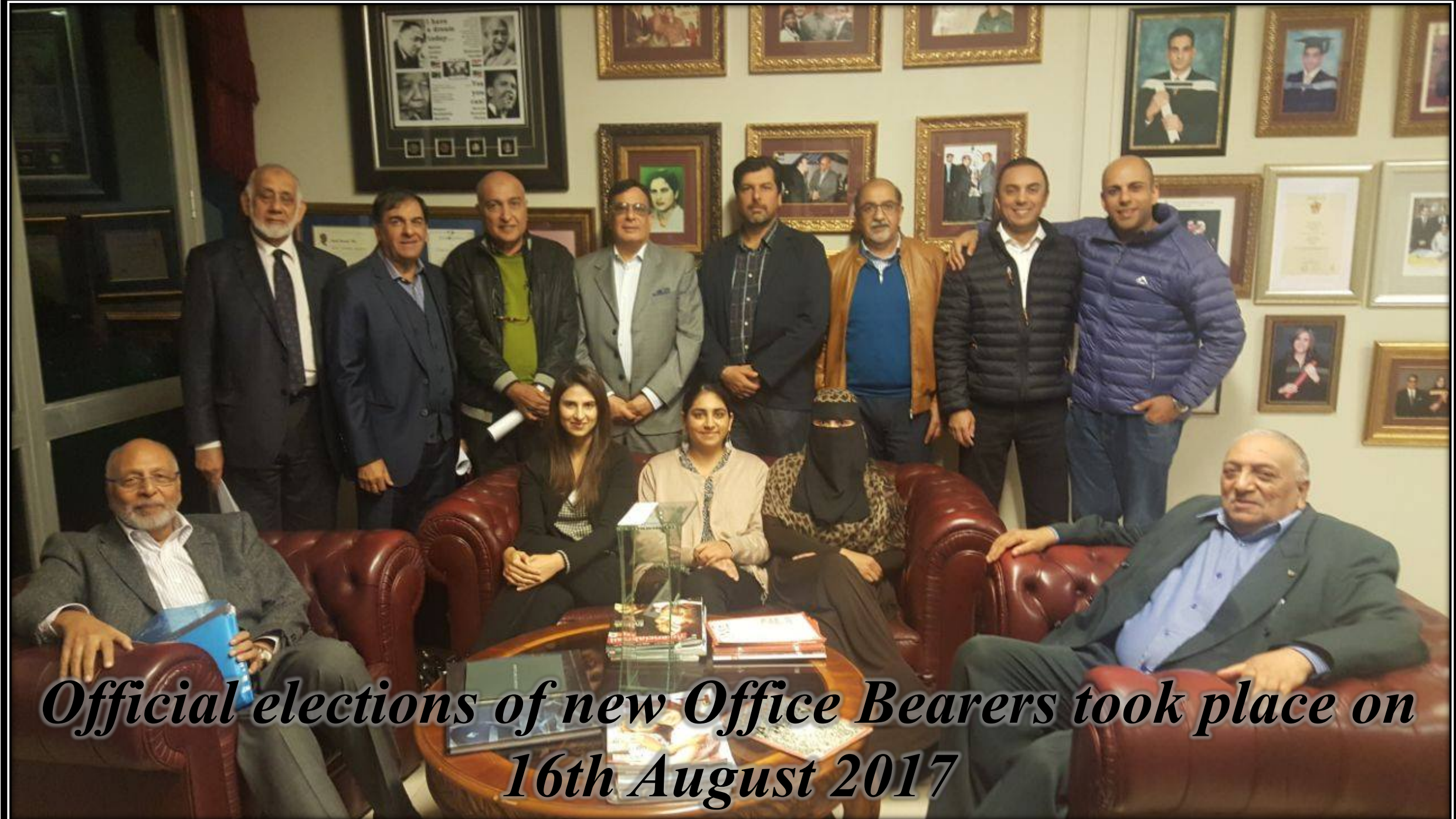
Official elections of new Office Bearers took place on 16th August 2017